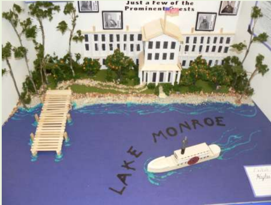
Social Studies Winning Display