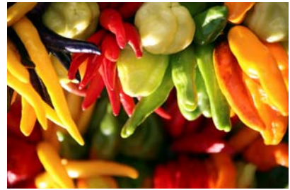
"BEST CHILI IN SOUTHWEST VOLUSIA!"

MARINER'S COVE PARK-1199 ENTERPRISE-OSTEEN RD ENTERPRISE, FLORIDA