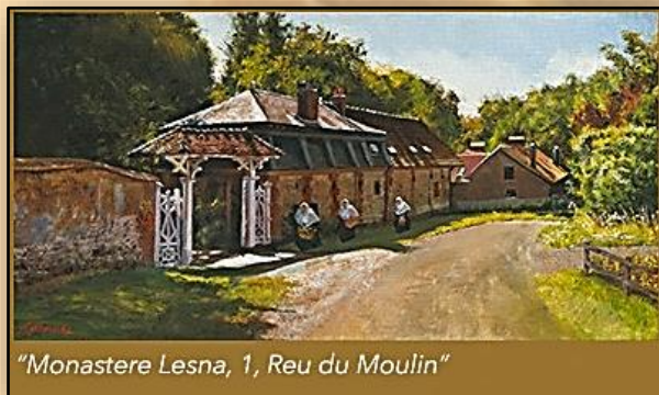
"Monastere Lesna, 1, Reu du Moulin"

Within the last several years he has returned to show his personal works to the public. He considers his artistic schooling to have been "intensely" classical and acknowledges that the creating of art is intertwined with his life.