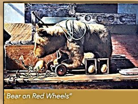
"Bear on Red Wheels"